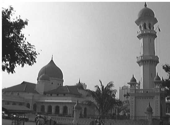
Kapitan Kling Mosque

This community covers the areas of Acheen Street, part of Armenian Street and Kapitan Kling Road, up to the Kapitan Kling Mosque, behind which is a sizeable area of waqf land. The starting point for this Zone is the Kapitan Kling Mosque, which is highly visible from the main road.