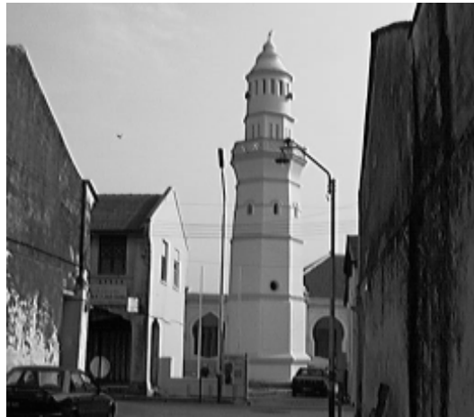
Acheen Street Mosque

The mosque has been the locus of both social and economic activities, which can still be seen around it. Another symbol of the Islamic community is the Lebuah Aceh Mosque, reflecting an area once richly populated by people from Aceh, Indonesia, confirmed by the existence of graveyards with stones resembling those of Sumatra's and Riau's. This area was a service centre for those going to make the pilgrimage to the holy land of Mecca by sea, when Penang was one of the departure points. Pilgrimages by sea however, has become less popular because of the improvement in modern aircraft.