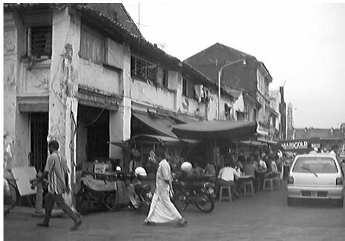
A busy morning at Little India

Penang's heritage assets can be classified into both tangible and intangible ones. As discussed above, Georgetown inner-city, where most treasured architecture is located, can be divided into several zones, along various ethnic lines. Its culture has been moulded by the successions of civilisations that arrived and shaped its urban growth. A closer look at these zones and the locations of some heritage buildings that dot the inner city exposes a strong sense of compromise between the pioneers, earlier settlers and the later immigrants. The street names could give us some indications of the history and the significance of an area. Bishop Street, Church Street and Buckingham Street indicate the influence of Christianity on that part of the city, proved by the existence of several churches along the streets. Aceh Street and Farquhar Street mark the arrival of Muslim Achenese and Arabs, in the early days of Penang. While China Street, as the name clearly states, denotes the congregation of Chinese early community in Penang. At Little India, there is a line of shops owned by Indian shopkeepers originated from South India selling necessities such as fabrics like the sari , accessories, statues and music instruments.