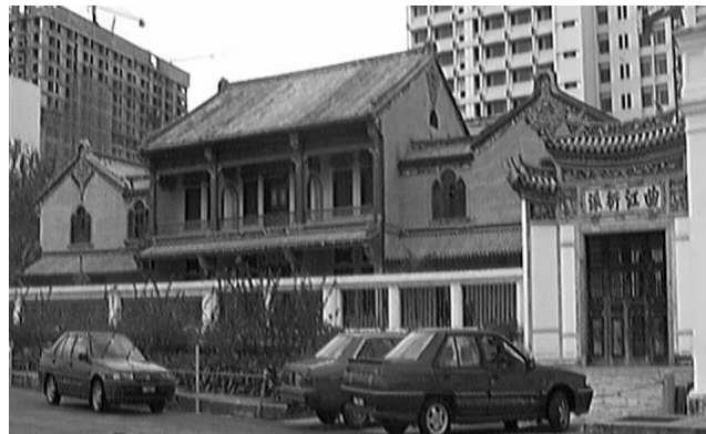
Cheong Fatt Tze Mansion

The streets of Penang keep thousands of untold stories of human interaction with mankind, the built environment and God. The historic buildings in Georgetown, some aged more than 200 years, were once regarded as 'outdated'. Not until recently have these buildings been revisited, appreciated and revitalized. Conservation and tourism activities have given these 'old' buildings a new life.