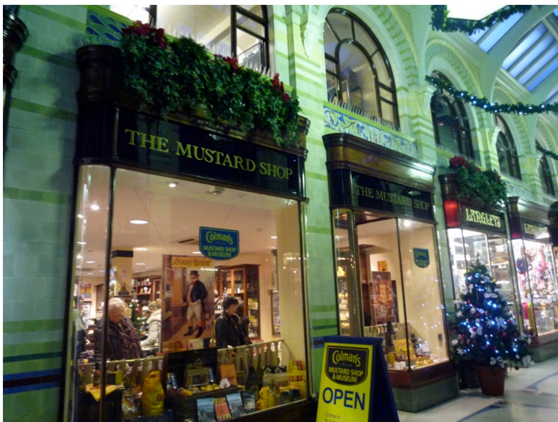
Figure 3 – one of the Shaping 24 heritage places in Norwich, England – Nov 2012

(Shaping 24, 2015) of a conference the author attended entitled Shaping 24 . This is an annual conference that celebrates the partnership between the two cities with the management and use of 12 heritage places in Ghent and 12 in Norwich supported.