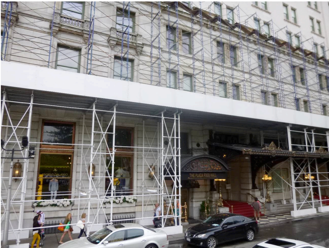
Figure 1 – a highrise preservation project underway in New York (May 2013)

In Canada, there is a similar approach to Australia, with consideration given to the fact that there is little government funding provided. Heritage Canada is the body that brings together heritage professionals with its support base similar to the National Trust in Australia, funding being mainly from donations and volunteer professionals. (National Trust for Canada, 2015)