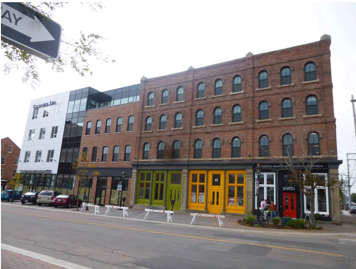
Figure 2 – the Welsh Owen Building in Charlottetown, Prince Edward Island (Oct 2014)

An example of one of these conversions comes from Prince Edward Island and is the conversion of a derelict carpark into flexible office spaces.