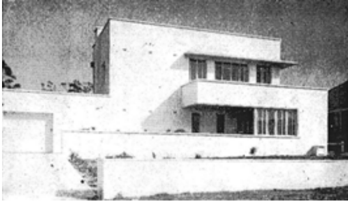
'Neo Classic' house 1954 by H. Stossel, in Sixty Beach and Holiday Homes , p.85